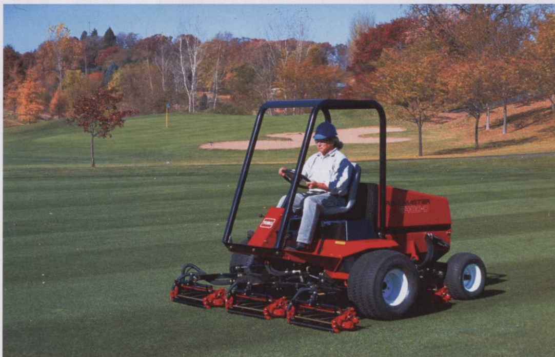
With five 21 inch units, the 2 and 4WD Toro Reelmaster 5200-D and 5400-D can be specified with 5 or 8 bladed 5 inch cylinders. In damp conditions, all-wheel drive can be of benefit, even of a relatively flat fairway

When trailed gang sets first started to be replaced by ride-on fairway mowers, the choice of models on offer was initially limited. Indeed, some of the earliest ride-on models had much in common with the five-gang commercial cylinder models upon which they were based. Fairway mowers have now changed considerably, but the trick still remains in matching the right mower to the job.