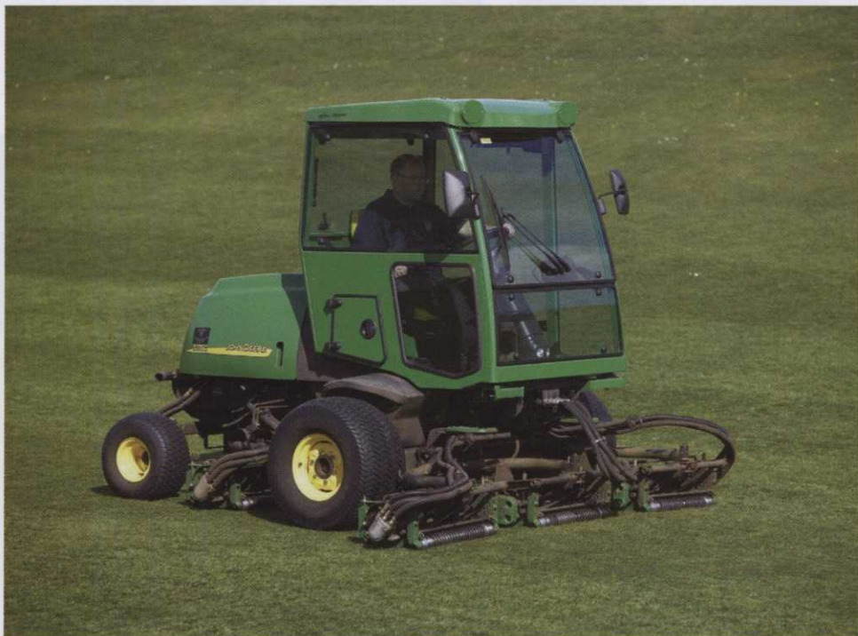
John Deere 3225C and 3235C models feature 22 inch cutting units, this now universally popular format being the size Deere has stuck to from day one. Cab option is increasingly popular, offering protection from the elements and stray balls

If the mowing equipment clock suddenly turned back to the mid-80s, many courses would be in trouble if modern kit had to be replaced with the best that was offered back in 1985. Staffing levels would probably need to be doubled and members would notice a dramatic change in the look and play of greens and fairways. Lost balls would triple overnight.