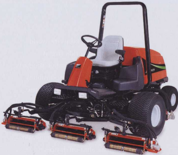
Jacobsen LF3400 and LF3800 models look pretty much the same, but offer a choice of 34 or 38hp power units to drive the five 22 inch units. The more powerful model is offered with 7 inch cylinders, against the 5 inch units on the 3400

Perversely, some suggest it is winter mowing that has influenced the uptake of light fairway models. With grass growing on through the season, being able to get onto the fairways to cut it with a physically light machine is a key issue. Compaction remains a concern, the footprint of light fairway mower often enabling grass to be cut in conditions when a larger ride-on is best left in the shed.