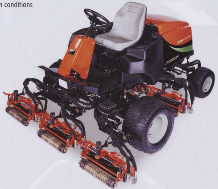
The diminutive Jacobsen LF1880, now offered in Turbo 33hp form, is claimed to be the lightest fairway mower on offer. Its narrow 18 inch cutting units even have the option of 'greens' specification 11-blade cylinders