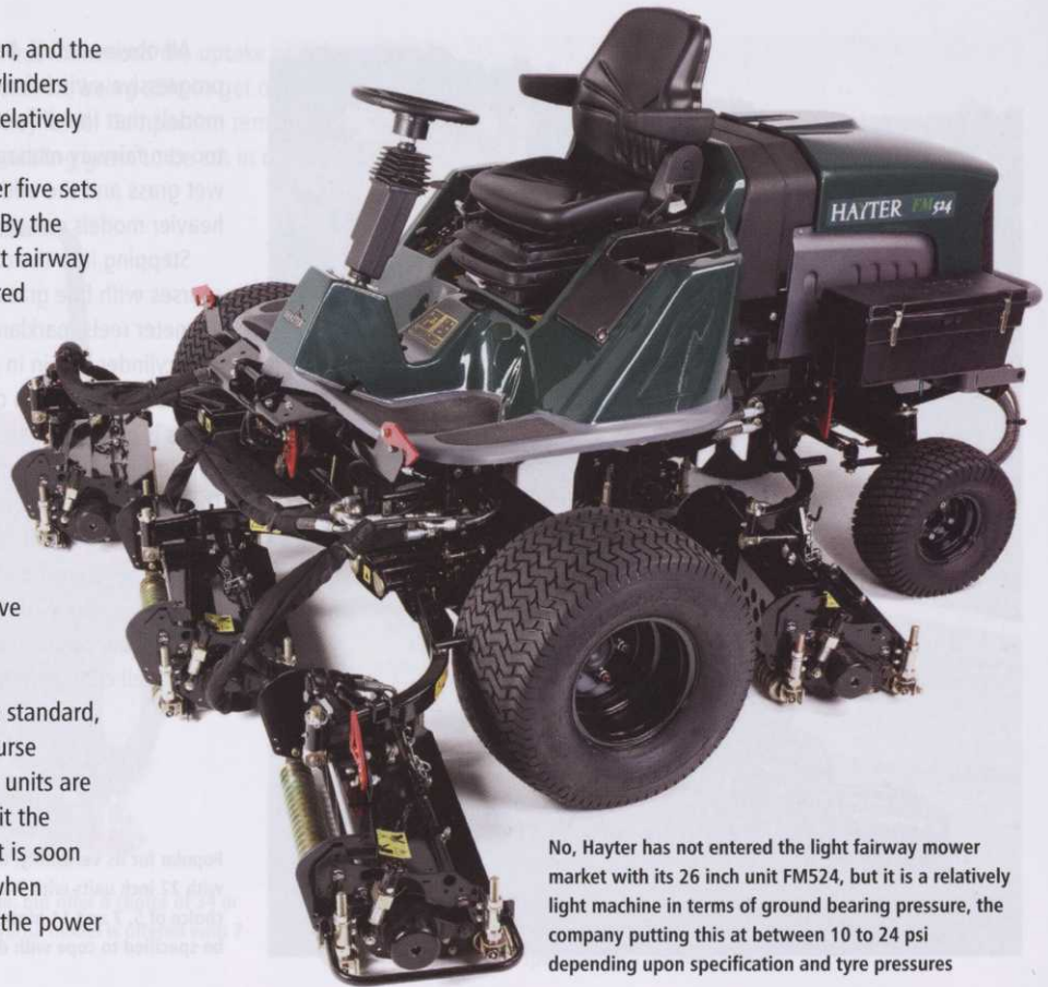
No, Hayter has not entered the light fairway mower market with its 26 inch unit FM524, but it is a relatively light machine in terms of ground bearing pressure, the company putting this at between 10 to 24 psi depending upon specification and tyre pressures

As such, it is useful to divide what is on offer into standard, light and ultra light categories. The description of course relates to the cutting units, but it is fair to say lighter units are associated with a physically lighter mower as well. Sit the extremes of what is on offer next to each other and it is soon apparent that the bigger the units, and particularly when seven as opposed to five gangs are fitted, the larger the power unit becomes.