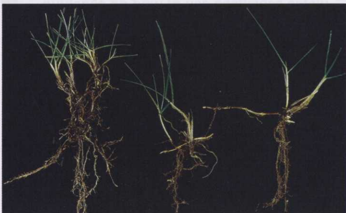
Comparison of three different red fescue types

The main objective in the management of golf courses in Denmark is to achieve sustainability, where the management and use of golf courses relies on the conditions of nature. This means low input of fertilisers and irrigation with little or no use of pesticides. Sustainability has been defined by the R&A as: "Optimising the playing quality of the golf course in harmony with the conservation of its natural environment under economically sound and socially responsible management".