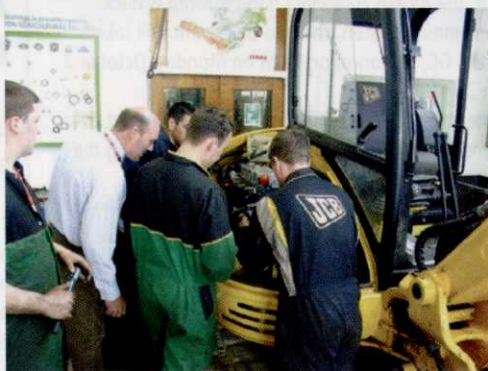
Visitors to Plumpton College were impressed by the Open Day's machinery displays

Set in a 700 hectare estate, at the foot of the picturesque South Downs, many visitors were keen to participate in guided walks, including the beautiful bluebell woodland, around the College estate. Garden lovers enjoyed the attractively landscaped grounds and colourful horticultural displays, while those with a sporting interest enjoyed the outdoor sports