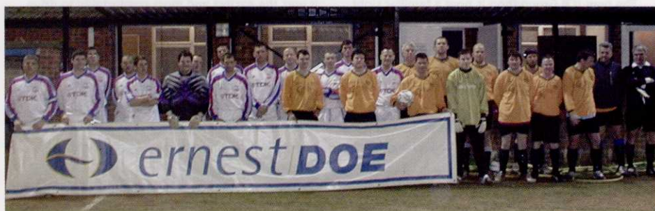
Surrey (in white) and Sussex (in yellow) BIGGA Section's, looking rather tired after their grueling game!

It was a fun, if somewhat tiring evening for some of the not-so-fit players, but the bar takings showed a healthy profit. The Surrey team went home with an engraved trophy, courtesy of the sponsors, while the Sussex team eventually departed vowing to avenge their defeat as they climbed aboard their coach for the journey home.