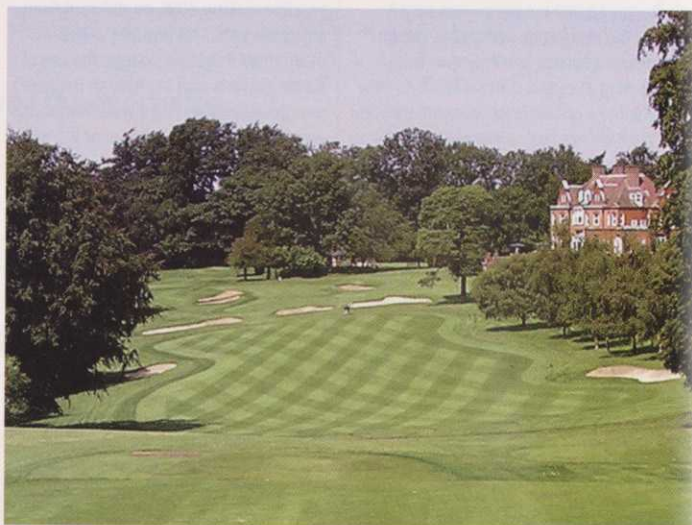
Tyrrells Wood GC