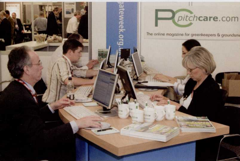
Left: The Internet Cafe, sponsored by Pitchcare, helped keep everyone in touch with the world