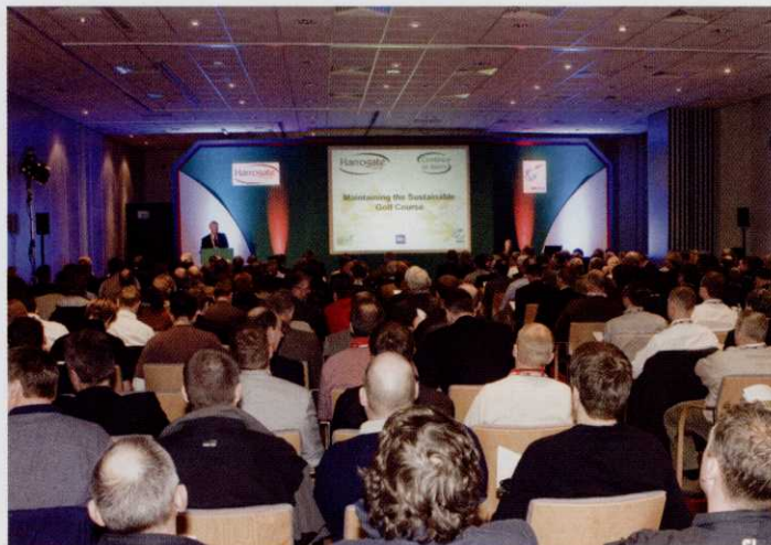
The R&A's Big Debate on Sustainable Golf caught everyone's imagination and was a fitting finale for Harrogate Week 2006