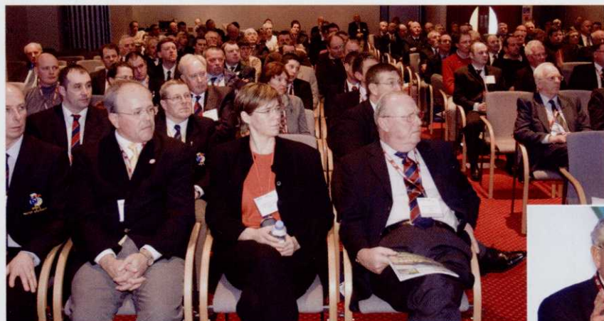
A packed house enjoyed Keynote Speaker Colonel John Blashford-Snell, right

While education was being provided upstairs progress was being made in the Halls as stand builders and exhibitors worked tirelessly to ensure that stands would look as attractive and welcoming as possible come the grand opening on the Tuesday morning.