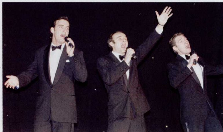
The Rat Pack's Back belted out the old standards