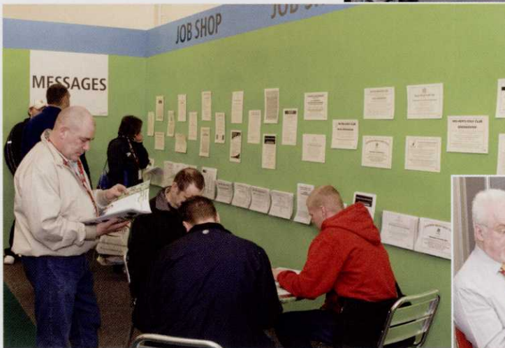
The Careers' Fair, sponsored by Toro, was again a useful component of the week