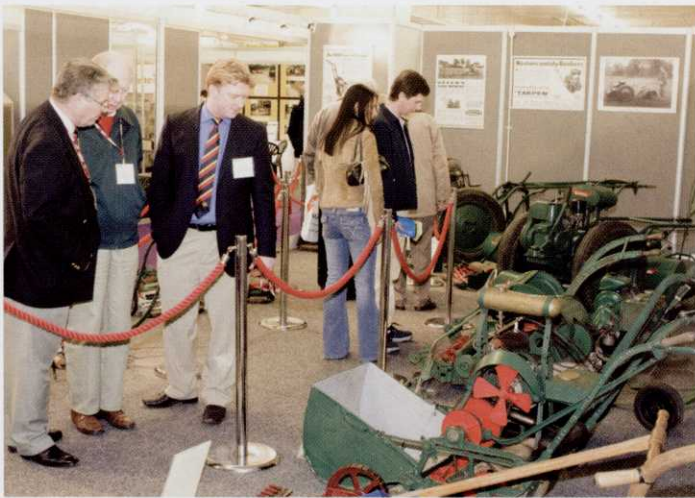
The Museum brought back many a memory of yesteryear