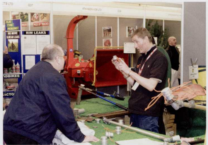
The show allows visitors to chat with the experts

The AGM was followed by the Bernhard's Reception where the 10 BIGGA Scholarship Delegates to the GCSAA Conference and Show in Atlanta were presented with their tickets. The event grows each year and the latest delegates brings to 60 the number of people who have benefited