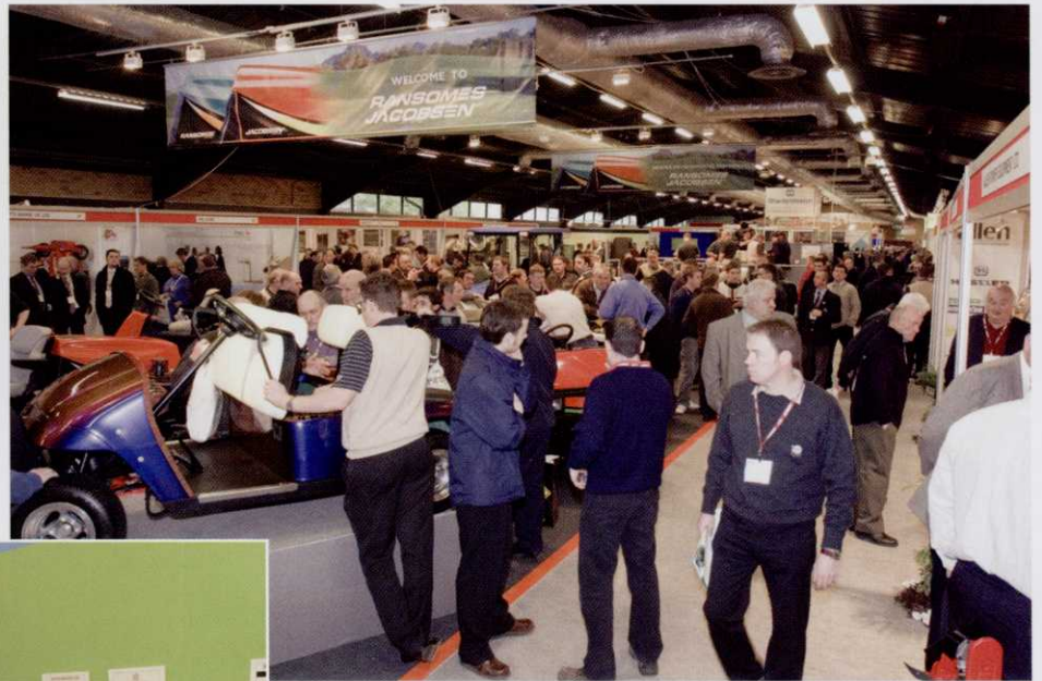
Busy busy busy - it was all go in the halls!