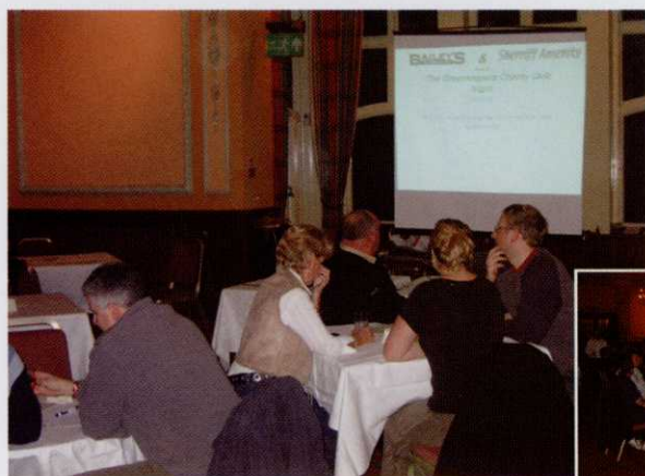
The Sherriff Amenity Quiz tested the best the Fine Turf Industry had to offer on Tuesday Night