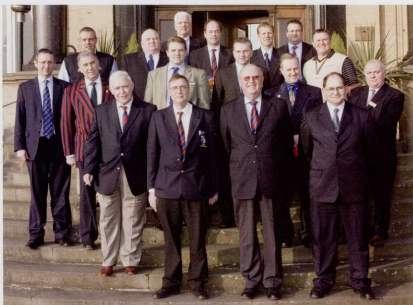
The Chairman's Lunch was a chance to recognise BIGGA's Golden and Silver Education & Development fund supporters