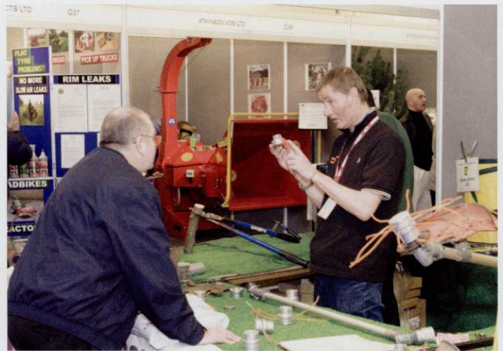
The show allows visitors to chat with the experts

The AGM was followed by the Bernhard's Reception where the 10 BIGGA Scholarship Delegates to the GCSAA Conference and Show in Atlanta were presented with their tickets. The event grows each year and the latest delegates brings to 60 the number of people who have benefited