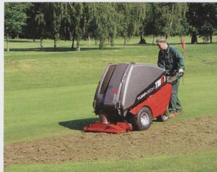
The TM1 clearing scarified material from the 16th green at Worcestershire Golf Club

"Previously, it took five men around five days to complete the work across all 19 greens. There was one man on the Graden, two with back-pack blowers and two picking up and disposing of the removed thatch. Following the arrival this spring of the new TM1, we are able to finish the job in two days using just two men," said Graeme.