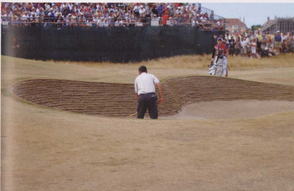
A Support Team member in action