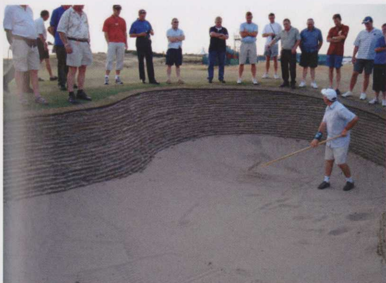
The Wednesday evening Bunker Masterclass proved very informative.