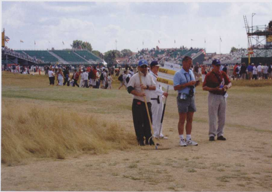
Final round action