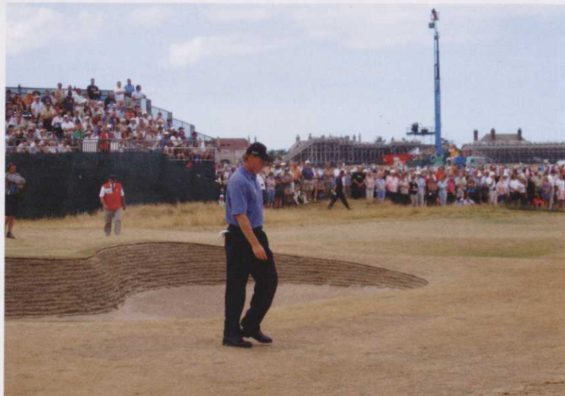
Ernie Els on the 5th