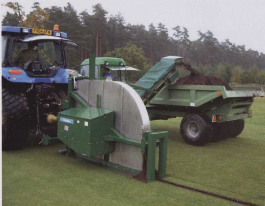
A Supertrrencher installing a 80mm diameter piped drain. There need be no disruption. The trailer has to spread the weight and the 4 wheels in line protect the turf

The very mention of installing drainage on golf courses conjures up for many pictures of upheaval and disruption lasting weeks or even months. It was not that many years ago but drainage technology and equipment have made rapid strides in recent times. Disruption is too strong a word to use, inconvenience would be more appropriate and is now measured in days.