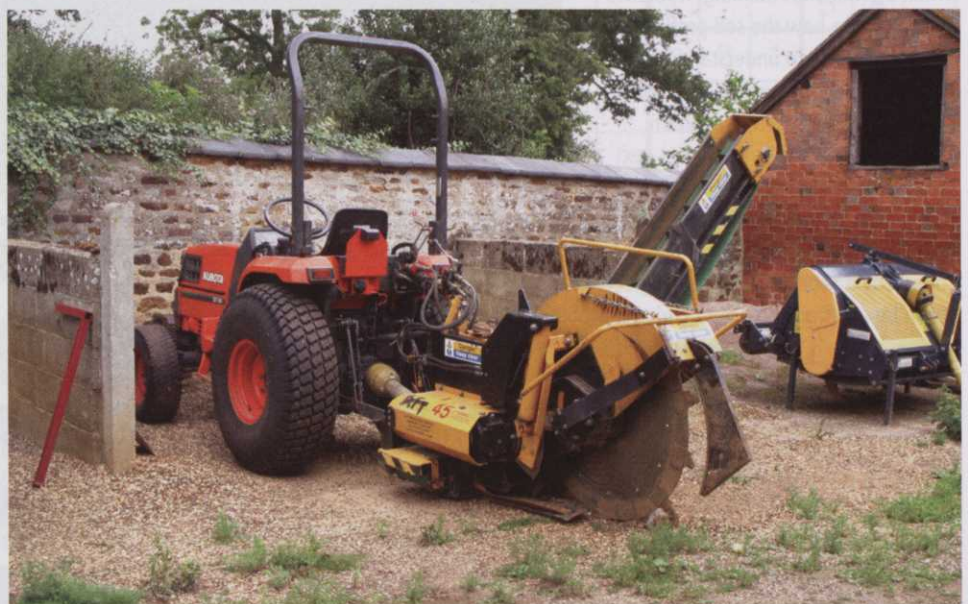
Ian Marshall, Head Greenkeeper at Wellingborough Golf Club, has carried out in house drainage and irrigation pipe installation on the course at Harrowden Hall using an AF Trencher, AF45, fitted with a Slitting Wheel. A job quoted out at £50,000 was carried out using the pictured combination for around £15,000.

Trenching machines can do a great deal more than produce a 'slot' into which a drainage medium can be backfilled. They can be used to lay drainage or irrigation pipe as well as be used to install under ground services including water and electric cables. Although it is tempting to compare this type of kit with 'microband' drainage tools, the way in which trenchers can be used is different. For a start, a chain