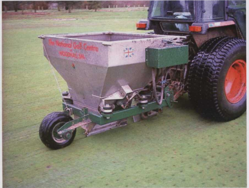
Gravel Band Drainage - equally effective on a green as on a fairway

Do not underestimate the amount of materials that have to be handled. In digging a trench 200 metres long, 110mm wide and 600mm deep, 13.2 cubic metres of soil are extracted. In the loose that is approximately 20 cubic metres. In weight terms, of the order of 20 tonnes, this has to be handled and carted away in less than an hour. This trench has to be backfilled with permeable fills totalling a similar gross weight. If the trencher is laying pipe while it digs then 40 tonnes may be handled in under 60 minutes.