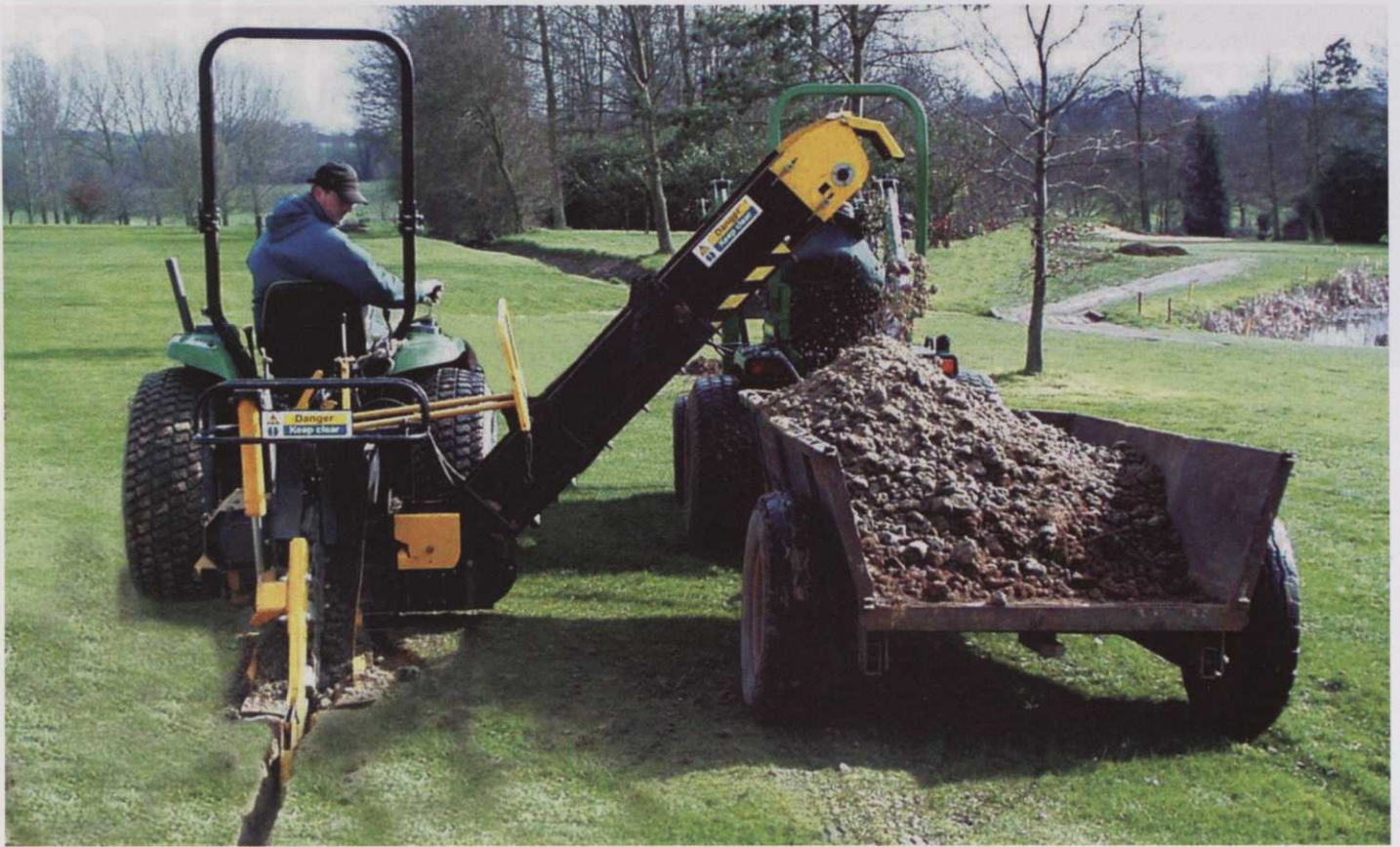
Chain trenchers can produce a clean, narrow slot. This can be backfilled or used to install a drainage pipe. When spoil needs removal, think carefully about the trailers used to do the job. On the wrong tyres and liable to overload, a trailer can do tremendous damage.

Next up are machines like the Shelton System 25. In the place of a slitting leg is a powered trenching wheel. Again, this will produce a 25 to 95mm slit, with a working depth adjustable between 200mm to 400mm. A vibrating backfilling hopper is fitted, this allowing the slit to be filled with a drainage medium that can again include gravel or Lytag.