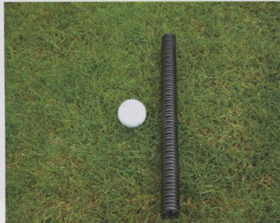
25mm land drainage pipes fits into a trench narrower than a golf ball