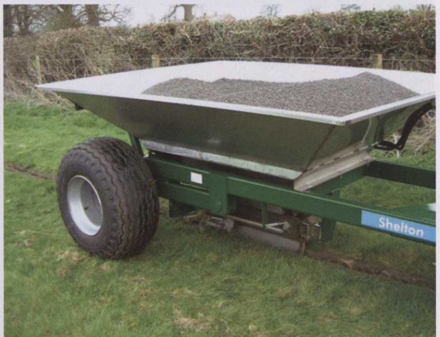
Fastflow 3 tonne capacity gravel backfiller places permeable fills at fast walking pace; no spills, no wastage

These pipe trenches may be topped with free draining sand, or a free draining loam based compost, which is then seeded. Better still is to turf over these 60mm wide scars with matching turf. If there is no natural fall across the fairway then the laser-guided trencher will ensure that the pipes are laid on a suitable gradient. These laterals in turn will flow into a main drain sited off the closely mown area. In this way the connecting sites, which cause the biggest scars, are less conspicuous. Nowadays drainage water is too valuable a product to waste, so the designer should consider where and how best it could be stored.