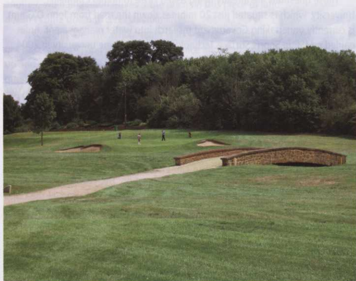
The club invested heavily in these handsome bridges