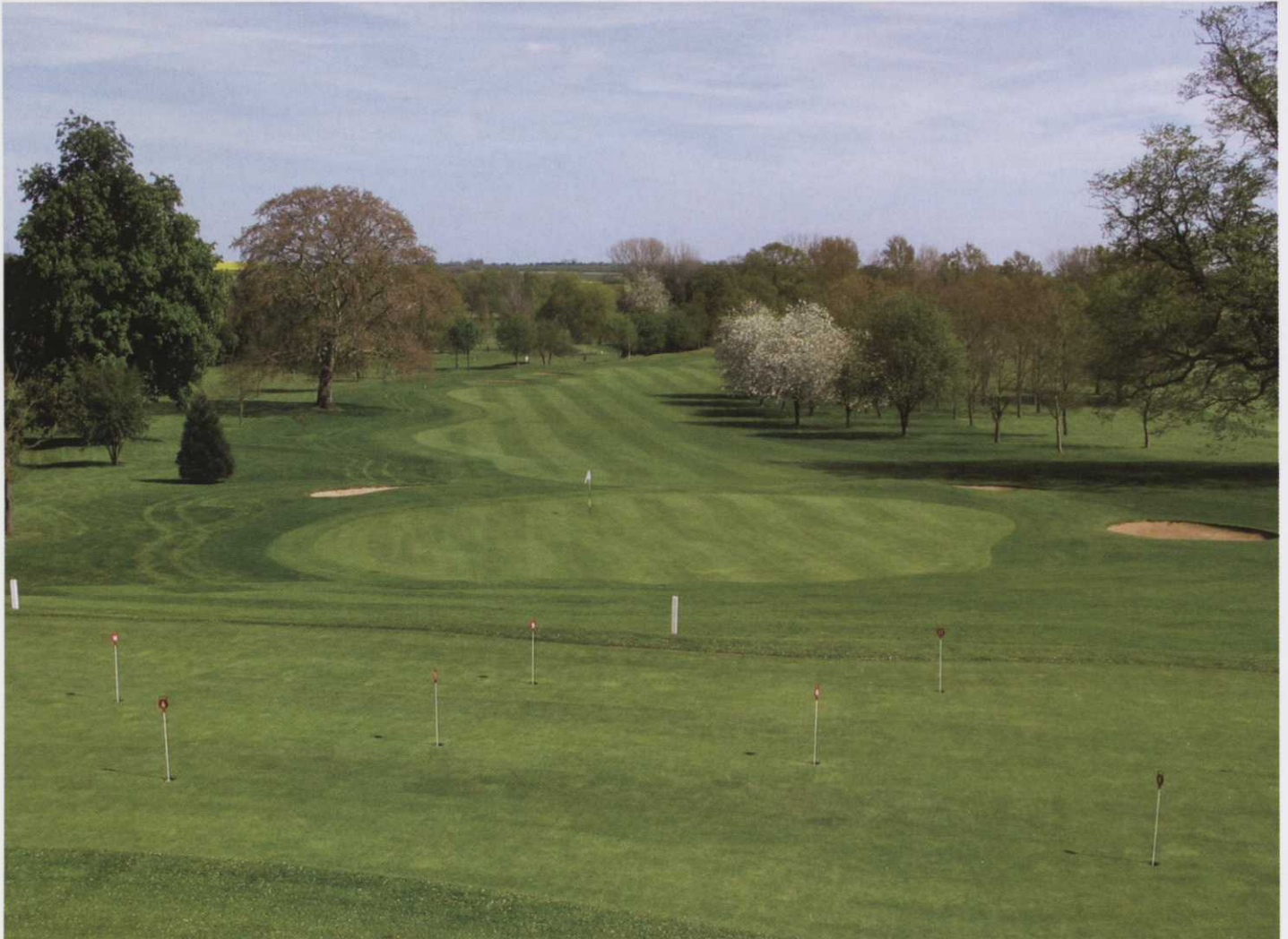
Colin is looking at irrigation systems, including a reservoir, that can keep the course in a healthy condition when the dry periods hit

"When the 13th flooded I think the club panicked. They want to see the course in a healthy state and will spend time and money to do it, but in this case when I look back we probably would have been best not doing what we did. We installed drainpipes and the water went - great, but now it drains too well, goes brown easily and gets dry lines. I've learnt that when you get one extreme like that you shouldn't over react, just grin and bare it and take a longer term view," stated Colin wisely.