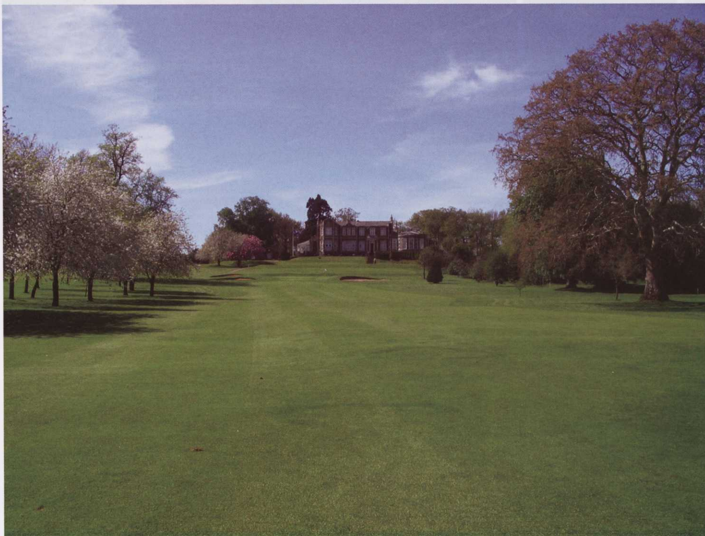
The splendid view walking up the 18th on the John O'Gaunt course

"It is just too expensive for us at the moment. It is frustrating because the land is just sitting there and would be great for us. With the ground being pure sand all we would need to do is install a liner and there you have it. Getting a winter extraction would safe guard our water supplies and we would be able to look after the courses all year round. The club know how important it is, they are very good like that, and they will eventually go down this route one way or another, we'll find alternatives if the price on this piece of land doesn't come down to a reasonable level.