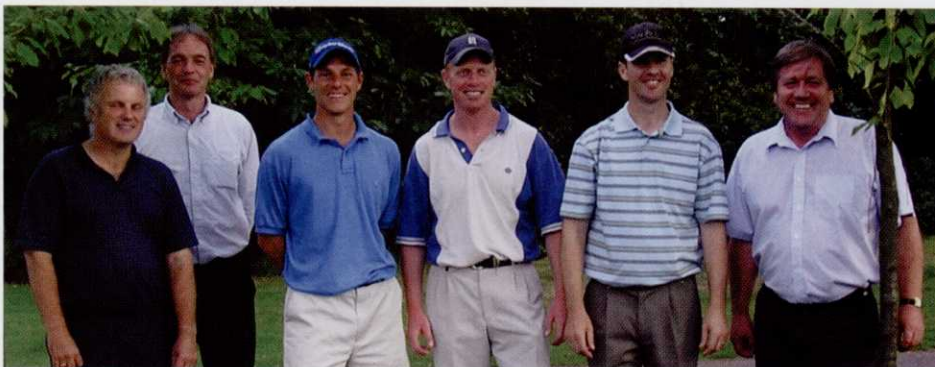
The Surrey Bowl Final cast