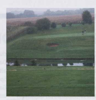
16 Changing the system at Chipping Norton

Your next issue of Greenkeeper International will be with you by December 7 2005