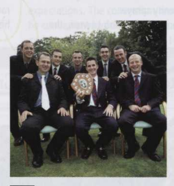
Another close final at BIGGA HOUSE