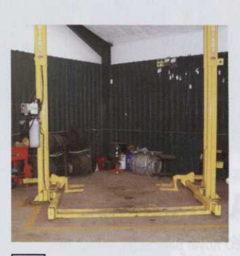
Investing in your workshop