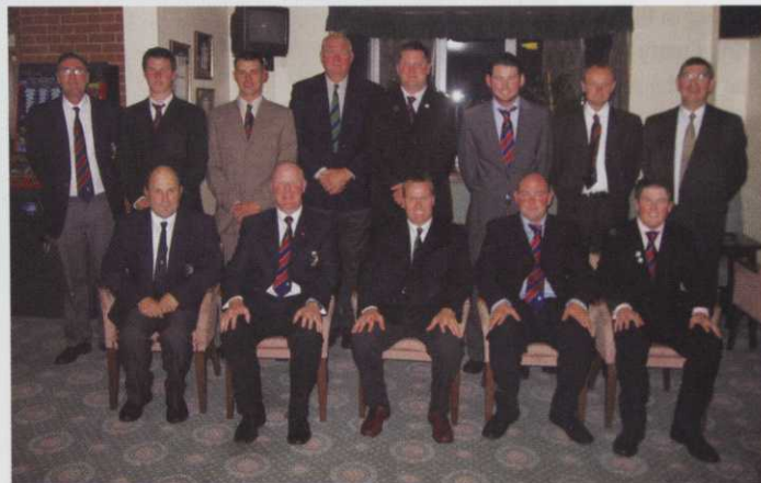
The glorious and triumphant BIGGA team

It is all the more so when you recall that last year, when the inaugural match was played at The Berkshire, the score in the Combined Services favour was 10.5-1.5, so for five of the team who played last year it was a case of sweet revenge.