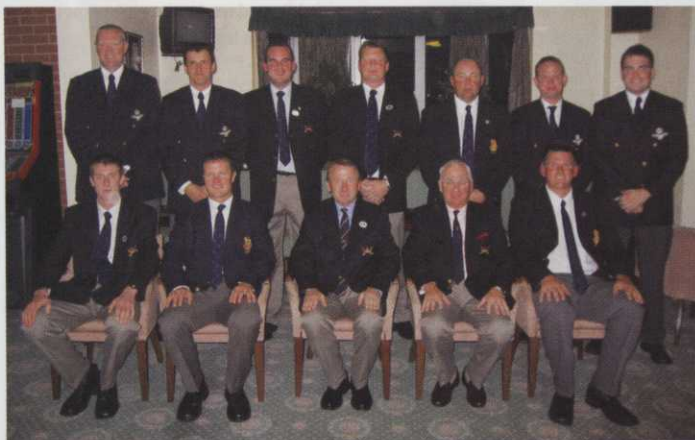
The gallant runners-up Combined Services team

Perhaps it doesn't rank up there alongside Bangladesh's historic one day win over Australia in the summer or Northern Ireland's defeat of England in the World Cup Qualifier but the BIGGA Scratch Team's 6.5-3.5 win over the Combined Services Team at Burton Golf Club was an exceptional effort.