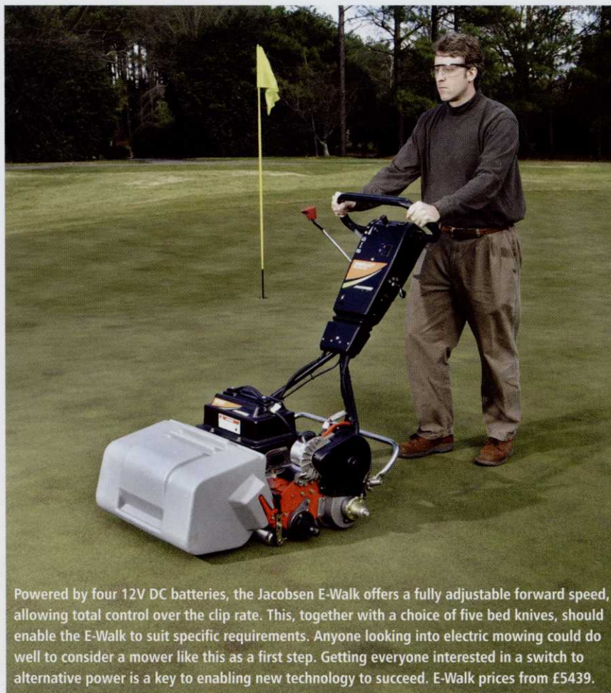
Powered by four 12V DC batteries, the Jacobsen E-Walk offers a fully adjustable forward speed, allowing total control over the clip rate. This, together with a choice of five bed knives, should enable the E-Walk to suit specific requirements. Anyone looking into electric mowing could do well to consider a mower like this as a first step. Getting everyone interested in a switch to alternative power is a key to enabling new technology to succeed. E-Walk prices from £5439.

LPG has its place, but it is currently unlikely to usurp either diesel or petrol as a primary fuel for internal combustion engines. Hybrid and electric power look like safer long term bets.