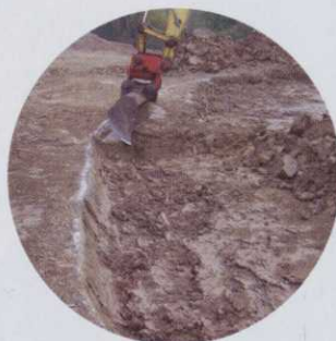
19 A look at hollow tine core greens