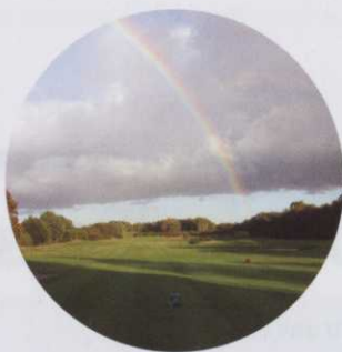
12 Course Feature - Alwoodley Golf Club

© 2005 British and International Golf Greenkeepers Association