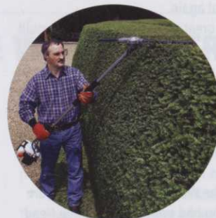
25 Best tools to use for hard to reach areas