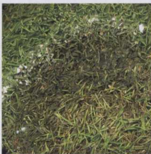
39 Do new turf diseases really exist?