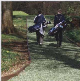
30 Recycled products are gaining popularity