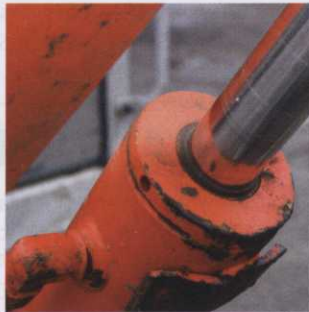
25 What to look out for when buying a mini-excavator