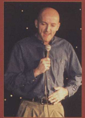
At his peak, Comedian Lee Hurst entertains the banquet in 1998