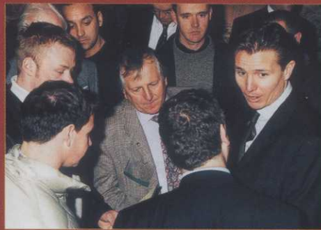
Inspirational: Keynote speaker and Olympic Silver Medallist, Rodger Black, wows the crowd in 2002