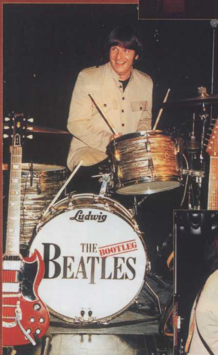
The Bootleg Beatles headline at a 60's influenced Exhibition in 2000