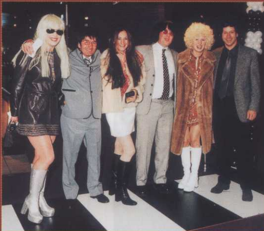
Guests get into the 60's groove in Millennium year