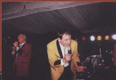
In 1999 Showaddywaddy strut their stuff at Harrogate