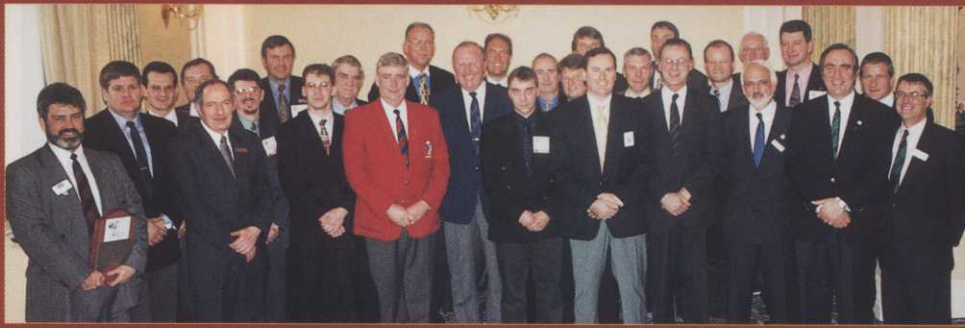
In 1998 BIGGA's Golden and Silver Key members donated £44,000 to equip the training room in the newly built BIGGA HOUSE