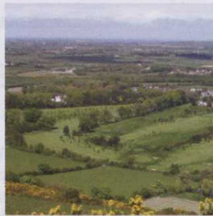
17 Racing ahead at Ramsey GC

Your next issue of Greenkeeper International will be with you by September 7 2005