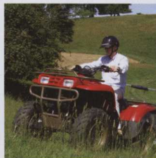
35 Work horse or plaything?