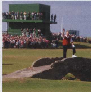
25 Special memories at The Open