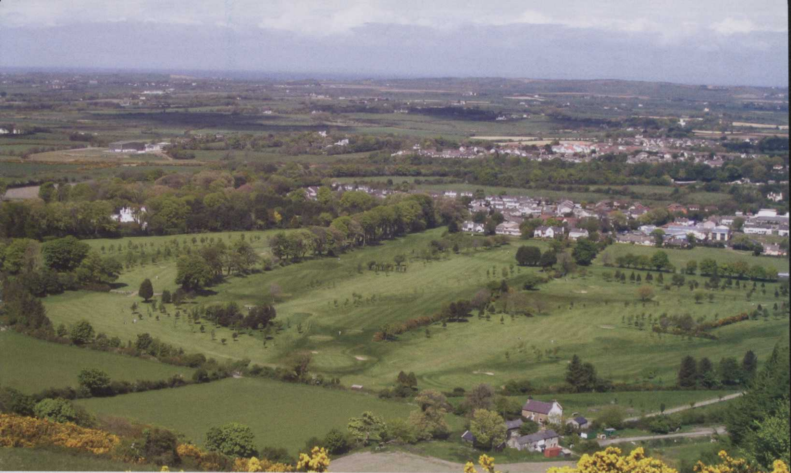
The course boasts some superb views

days as it wasn't a big enough order to do it straight away. I ended up driving the 16 miles from Ramsey to Douglas and picking them up myself.