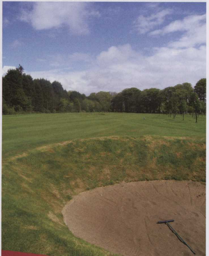
The team have been busy with a bunker reconstruction programme

"I recently ordered some speed rollers from Greentech and they were delivered to the island but then didn't arrive. I finally got the name of the company who had them and was told that they'd get them up to me in two