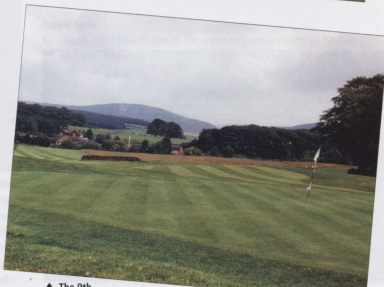
▲ The 9th