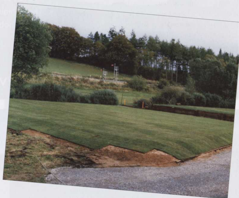
▲ Construction of the new 16th tee