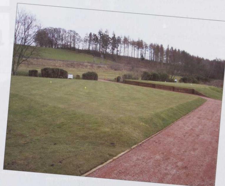
▲ The 16th tee as it looks today