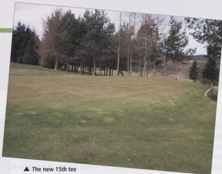
▲ The new 15th tee