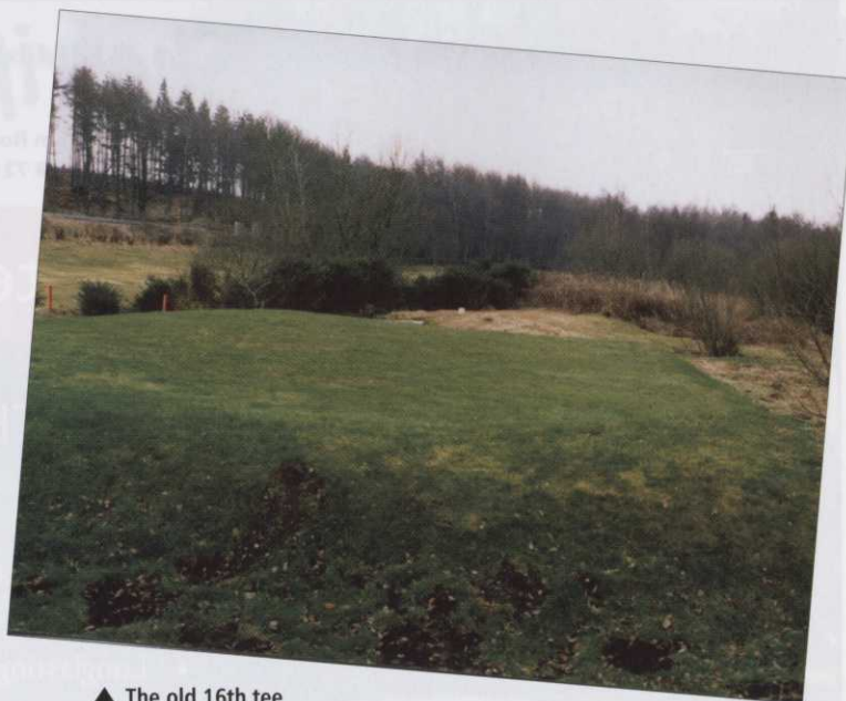
▲ The old 16th tee