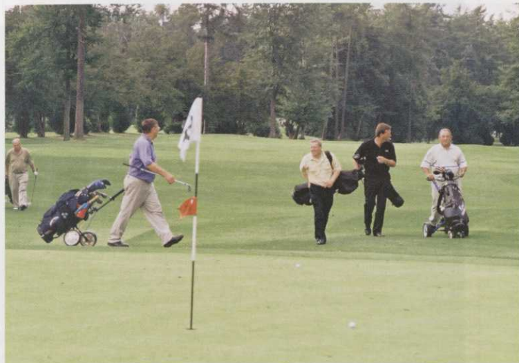
▲ The BIGGA Team look set for birdie.