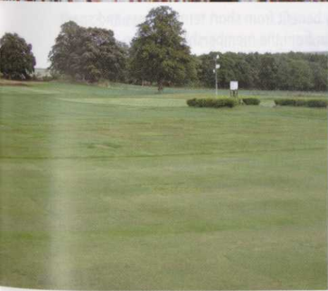
▲ Centre: Anne Wilson, Head of External Affairs. Left: The STRI Trial Fields. Top: The entrance to the STRI offices in Bingley.

weeds and pests was just not possible, while there was only manual or horse drawn machinery. Another issue was that back then there were no grasses bred purely for amenity use and the grasses on golf courses tended to be from agriculture."