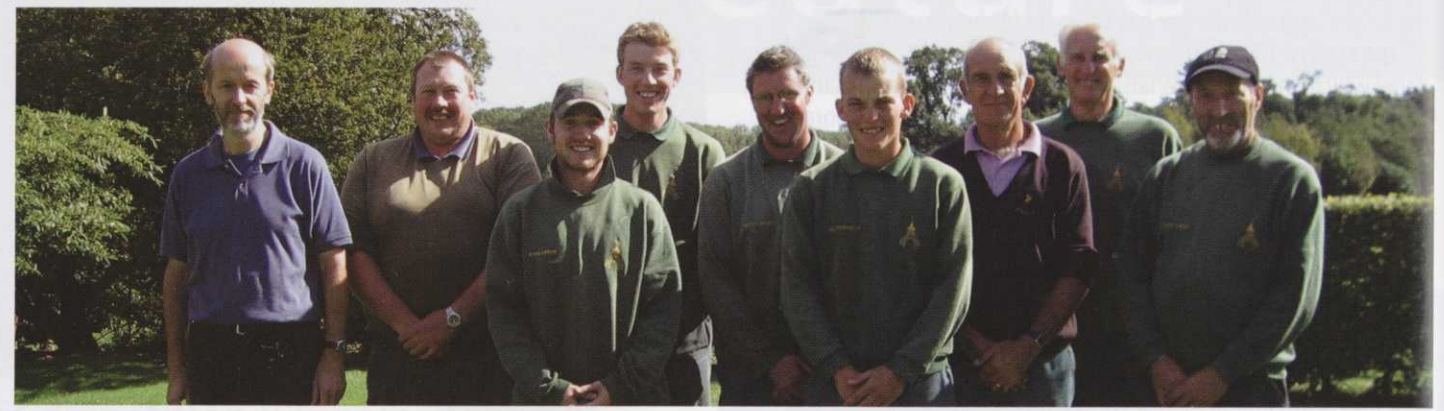
The Kenwick Park team.