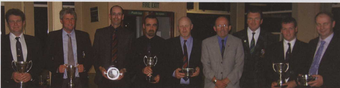
Central Section held its autumn meeting at Downfield GC, in Dundee, and a full field enjoyed facing the demands of one of Scotland's toughest inland courses. The photo shows the cream which rose to the top during the day.