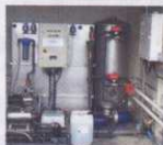
The ENZYMATIC15 wash water recycler. Designed & built in the UK by ByWater

Tel: 01530 563388 Fax: 01530 563399 Email: sales@bywaterservices.co.uk Web: www.bywaterservices.co.uk