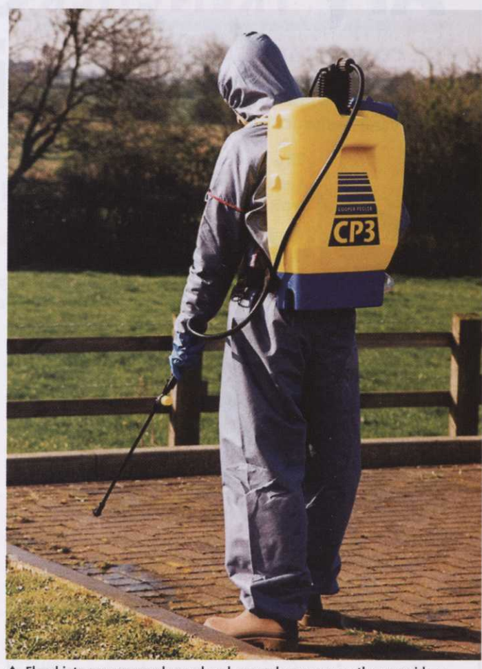
▲ Flood jets are commonly used on knapsack sprayers as they provide a wide swath and are less prone to nozzle blockages

Any other advantages from better spraying practices? Wise operators will already know that when they use Very Coarse sprays or shrouded LERAP rated booms such as the Defender, anyone can very clearly see the much reduced drift. Although total volumes may be quite small — like Scottish midges in June — these small losses are becoming hugely troublesome to the bystander!