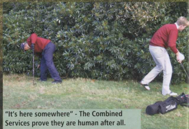
"It's here somewhere" - The Combined Services prove they are human after all.