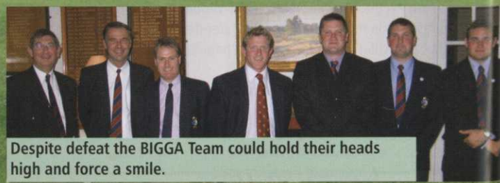
Despite defeat the BIGGA Team could hold their heads high and force a smile.