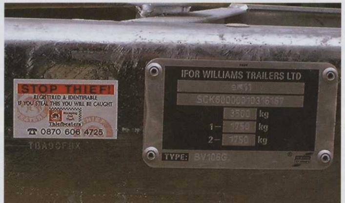
▲ Trailer drawbar warning

For existing building these companies also offer cabinets or cages constructed from heavy-duty steel for interior storage of smaller equipment. While this type of unit is ideal for secure storage what happens when the smaller machinery or tools are out on a course? No one is infallible and there are going to be occasions when equipment is left exposed in the back of a trailer or truck – a temptation for the opportunist thief.