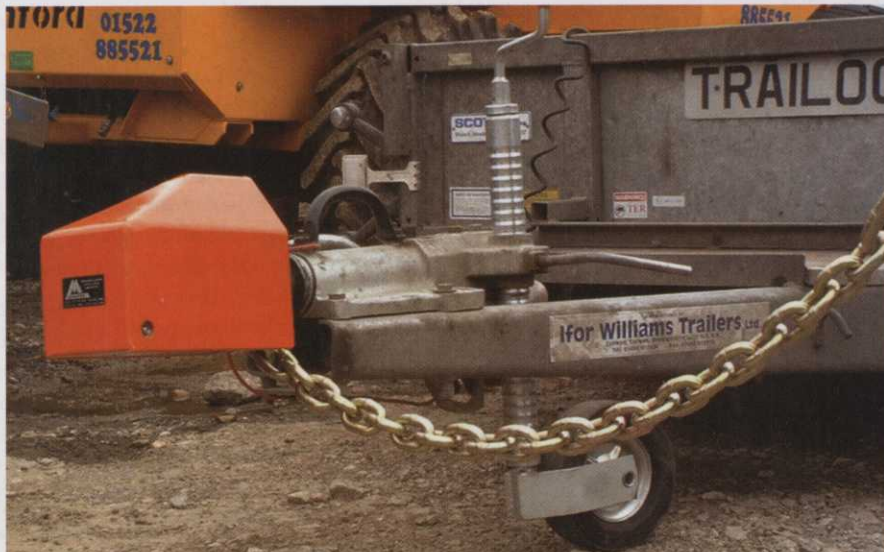
▲ HD Hitchlok and HD Security Chain

To contact Security Companies see Security in the Buyers' Guide.