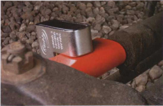
▲ Close up of Ramlok

Roland Taylor looks at ways of preventing the greenkeeper's worst nightmare