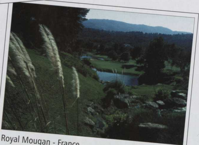
Royal Mougan - France