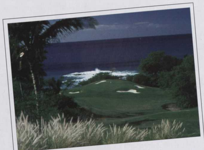
Mouna Kea - Hawaii