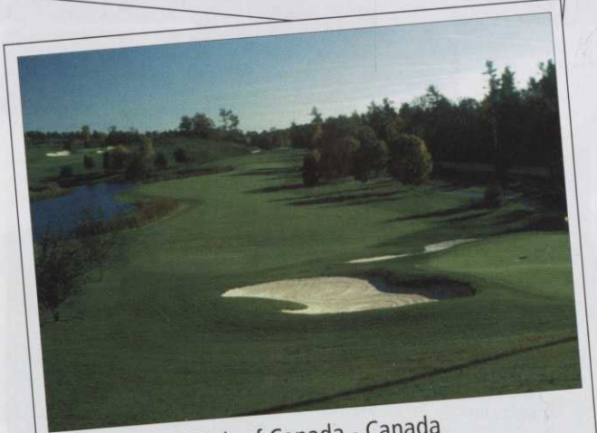
National Golf Club of Canada - Canada