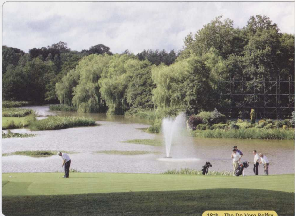
18th - The De Vere Belfry

Whickham Golf Club was founded in 1911 and has around 700 members. Set in the Derwent Valley, it is a picturesque course with spectacular views, although it is only a few miles from Gateshead's Metro Centre.