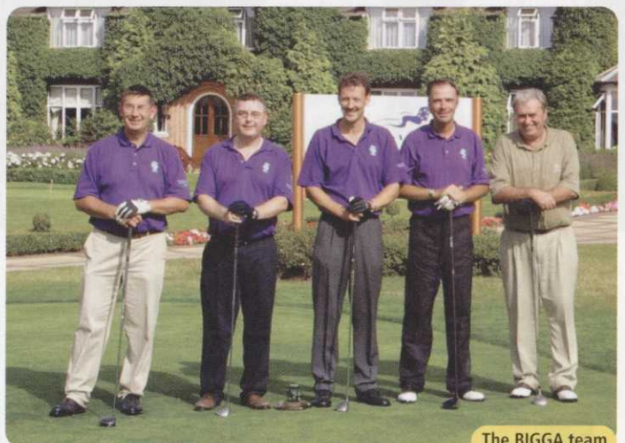
The BIGGA team

At the awards ceremony John Deere Limited also made a donation of £25 for every British team entered, to support BIGGA's educational activities. Donations are made to greenkeeping Associations in all the countries which take part in the Team Championship.