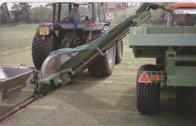
A trench being cut on a green prior to the installation of a 60mm pipe. Note the turf has been removed along the line of the drain. Bands running at 90 degrees to the pipe are 25mm trenches cut with a wheel trencher and filled with Lytag