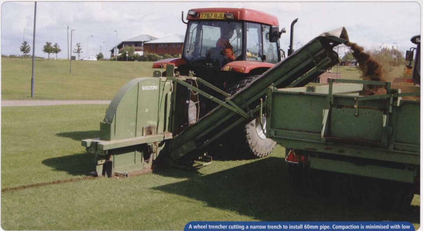
A wheel trencher cutting a narrow trench to install 60mm pipe. Compaction is minimised with low ground pressure turf tyres fitted to the tractor and a 4 wheel in line trailer to carry away arisings

The secondary system is for dealing with surface water and channelling it down to the primary system. This is usually achieved by slit drainage which relies on the water flowing freely through a course material which has pores big enough not to restrict its movement. The slits or narrow trenches are directly linked to the underground system, so the run off is not slowed down in the soil profile. A small diameter flexible drainage pipe, which is perforated, can be installed in the bottom of the slit and this is connected to larger outflow one. The slit is then filled to just below the surface with a course free draining aggregate.