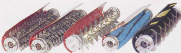
Groomer Scarifier Star Slitter Rotary Brush Deep Slicer