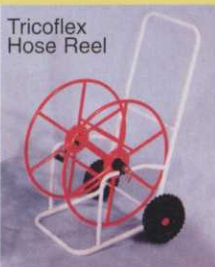
Tricoflex Hose Reel

For a copy of our 2003 catalogue please fax your address details to 01423 522969