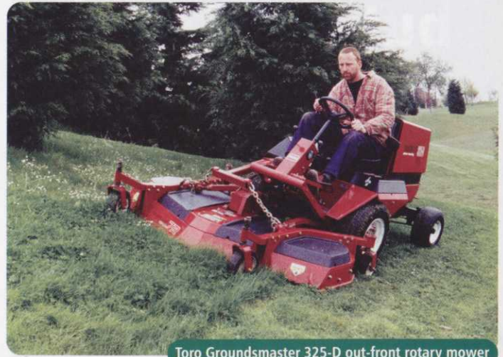
Toro Groundsmaster 325-D out-front rotary mower

In this country the development of the rotary system was largely due to Douglas Hayter. From a small factory at Spellbrook on the Hertfordshire/Essex border he introduced his first machine, a 24" pushed rotary mower. The famous Hayterette quickly followed this, but both these units were aimed at the owners of large gardens with orchards. In talks with a Bishop's Stortford agricultural dealer it was decided to develop a tractor mounted rotary mower for use in orchards. Apple production was prolific along the Suffolk/Essex border and throughout Kent and Cambridgeshire so the potential market for this type of machine was encouraging. At this time golf courses were few and far between. A prototype machine was built around the little 'Grey Fergie' which was the most popular tractor for orchard work because of its size. At one of the Essex Agricultural Shows in the early 1950's Hayter launched their 6/14 tractor mounted rotary mower - the first of this type of machine in the world. It consisted of a PTO and belt driven 6-foot main unit with three rotary cutting heads. To this could be added wing units that then made the total width of the mower 14-foot. Swing-wings were also available which, when they came in contact with a fixed object, would fold back. This meant the machine could cut close to trees and fences.