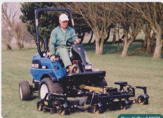
New Holland MC35