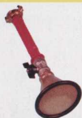
Hand Held Rose