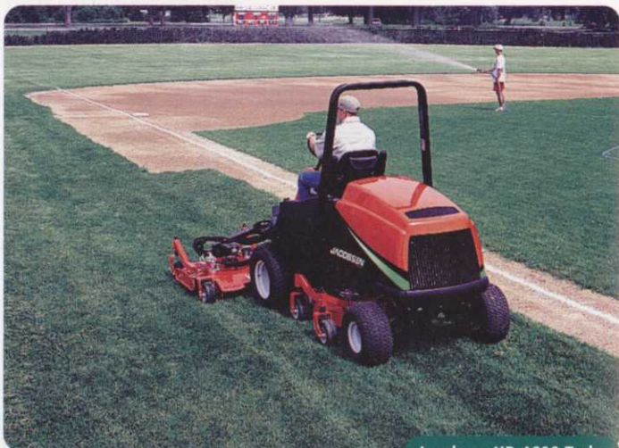
Jacobsen HR-4600 Turbo