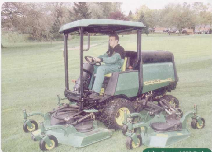
John Deere 1600 Turbo

To receive our 2003 catalogue fax your address details to 01423 522969 or email at info@greenkeepingsupply.com