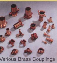
Various Brass Couplings