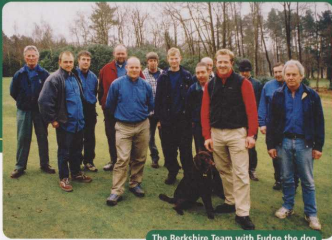
The Berkshire Team with Fudge the dog