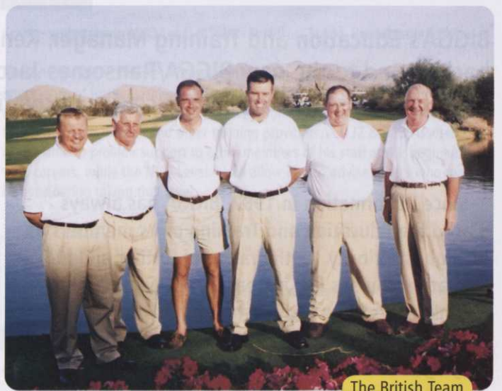
The British Team

Thanks also go to Brokenhurst Manor who represented themselves and the Association so well, and to everyone else that supported the