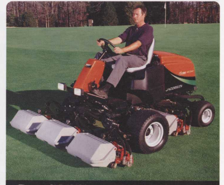
The new SLF-1880 is a super lightweight fairway mower producing excellent results on undulating fairways

For further information Tel: 01473 270000 Fax: 01473 276300