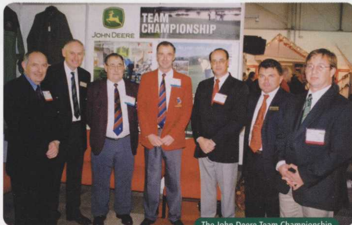
The John Deere Team Championship

"The championship's success in GB and Ireland has exceeded all expectation in its first year. Altogether 27 dealers took part in qualifying