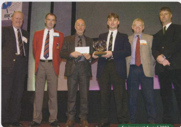
Environment Award 2002