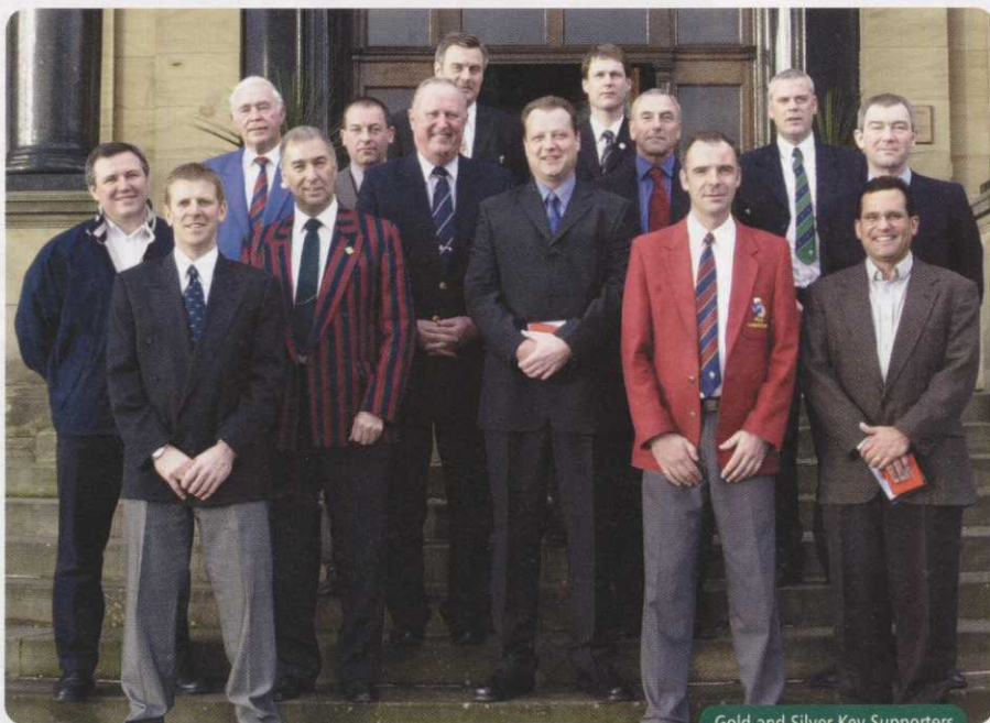
Gold and Silver Key Supporters

I hope that I have been able to paint just a small picture of the background and planning of a much anticipated event. Each year we look to learn and innovate for the future. We believe our partnership with the industry is vital for ongoing success. We also firmly believe at BIGGA HOUSE that each year we must improve on what has gone before and with that in mind we will set our sights on 2004 being bigger and better than ever.