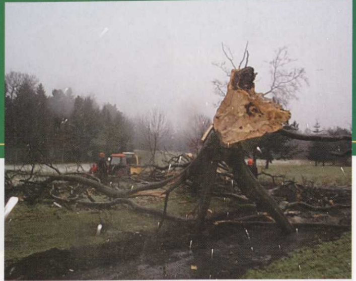
▲ The club has a superb policy on tree management

"A lot of architects may feel that we should have got the professionals in but as a private members club we have a limited budget to work with. As well as feeling confident enough to produce a green which, when finished, you have improved on what was there, and it looks natural in its surroundings it means we have completed a successful project."