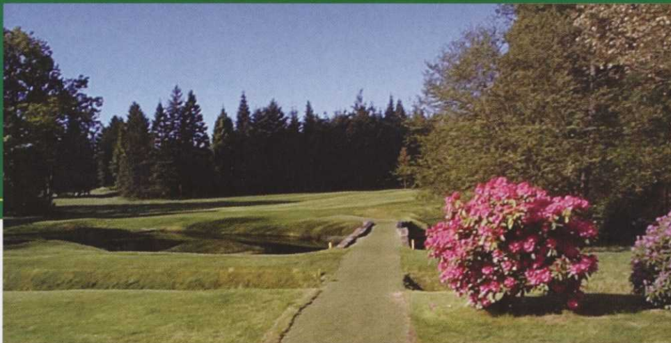
▲ Path to the 11th