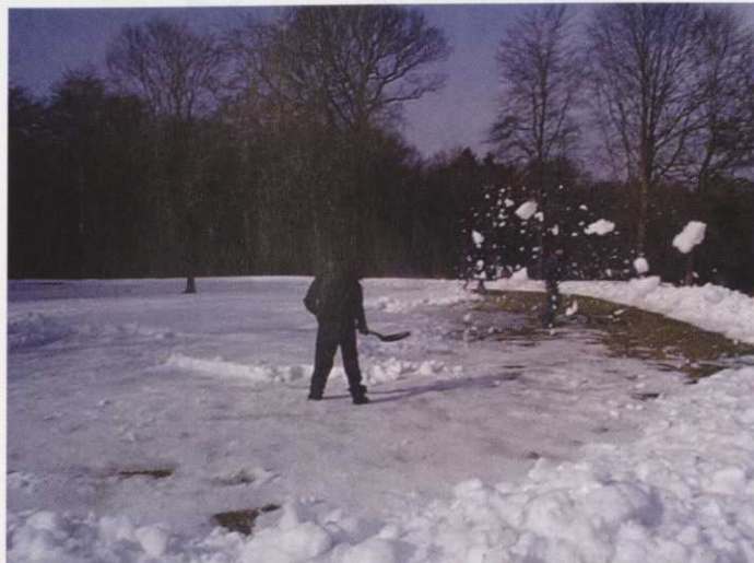
▲ Snow is a big problem at Downfield, but they have come up with solutions