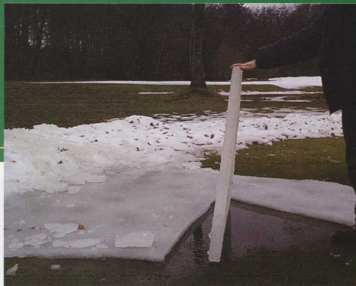
▲ Removing ice from the 5th green

"Meadowgrass is never going to survive here and what I found when I arrived was that the edges of greens were quite good but the centres were thin and yellowing because there was so much meadowgrass in them.