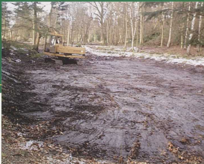
▲ Clearance work