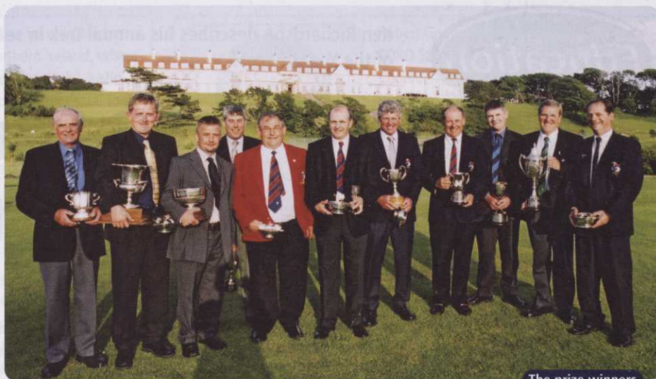
The prize winners