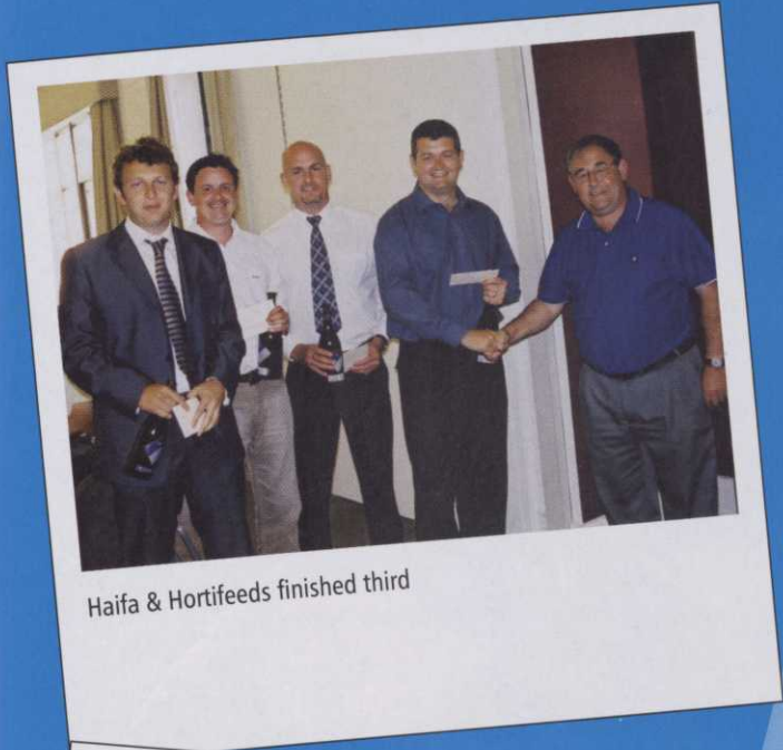
Haifa & Hortifeeds finished third