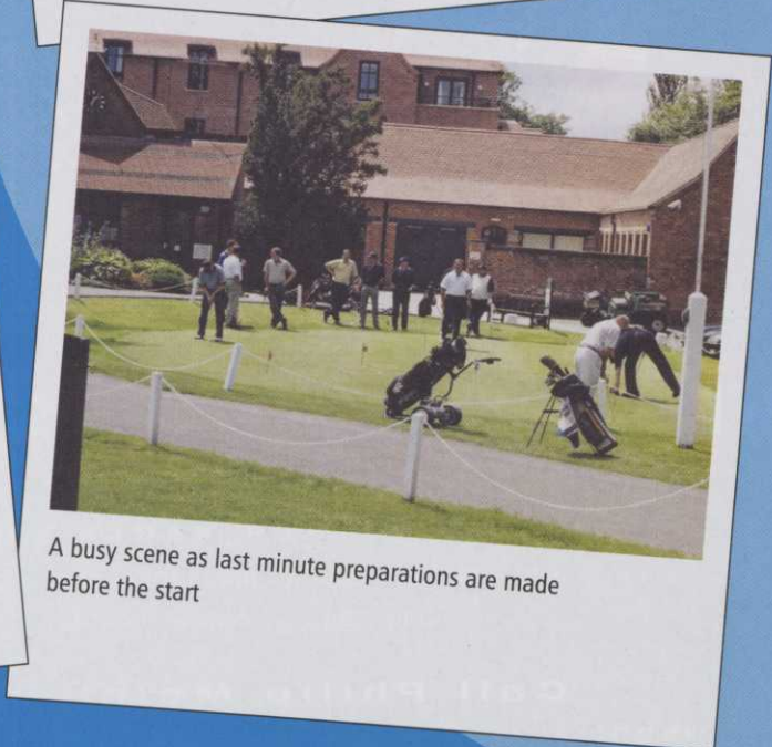
A busy scene as last minute preparations are made before the start