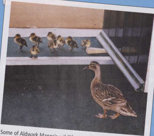
Some of Aldwark Manor's wildlife