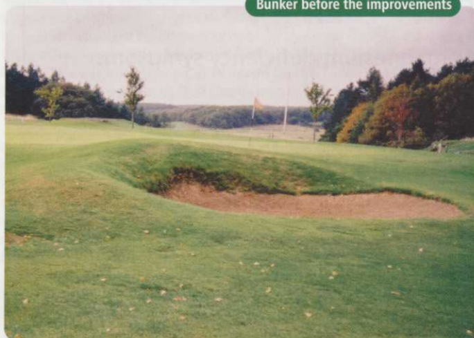
Bunker before the improvements

"I would say that the greatest achievement since I've been Course Manager has been to reduce disease by 100%. When I took over we were spraying fungicide once a month for Fusarium and Red Thread but after the first seven months we have only