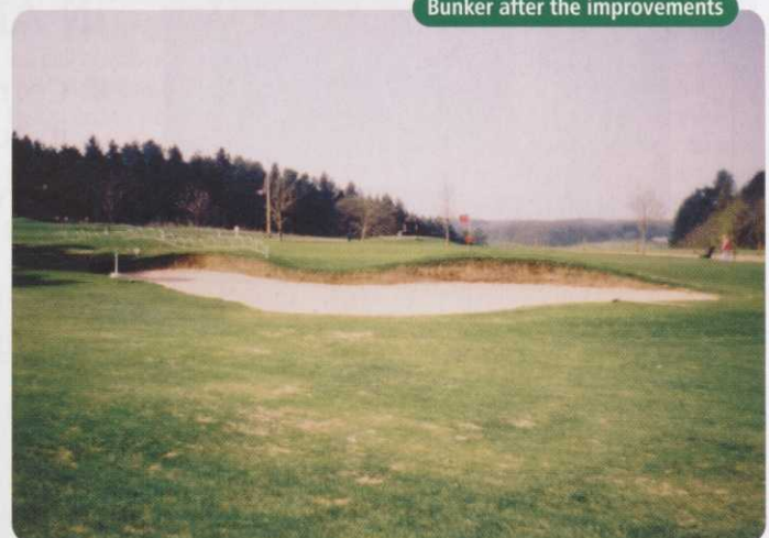
Bunker after the improvements