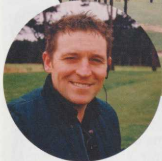
The current view from the 1st tee

If we are honest we all sometimes feel in a bit of a rut and hanker after taking the plunge and doing something completely different for a while. Thanks perhaps to the need to keep paying the mortgage most people resist the urge, soldier on and eventually work it out of their system. Others do make a life changing decision and head off in a completely new direction with varying degrees of success. Others treat it more as a sabbatical, a chance to spring clean the mind, and return to the profession they left with renewed vigour.