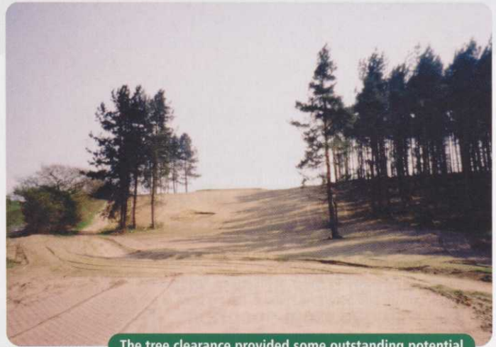
The tree clearance provided some outstanding potential

However it was his, previously underutilised administrative skills which were again put to good use when he won lottery funding for the club's heathland creation scheme.