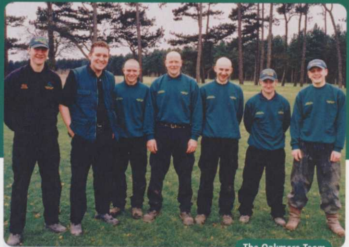
The Oakmere Team

the budget from day one - all the business side of things which I'd never dealt with before. He got me up to speed very quickly."