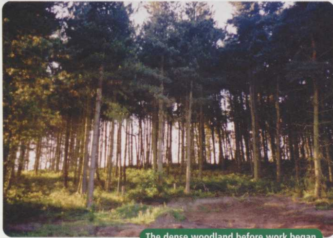
The dense woodland before work began

be producing more woodland perimeter and as most wildlife lives on the woodland edge we would be increasing the amount of habitat. We were also to be thinning the woodland which would extend its life."