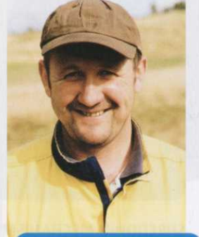
Hillside Greenkeeping Team