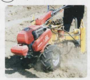
(24) Multi-tasking machines