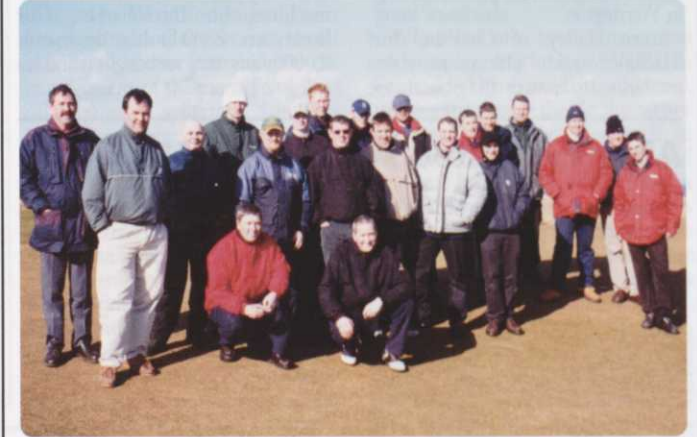
Members of the East of Scotland Section paid a recent visit to Kingsbarns Golf Club. The trip was in association with local Toro dealer, Henderson Grass Machinery (Haddington)

All machines are operated by Boughton Loam's own highly trained staff who have extensive greenkeeping and landscaping experience.