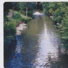
26 Looking after lakes and perfecting ponds