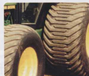
22 Tyres: Inflated ideas?