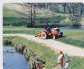
14 Greetham Valley Golf Club