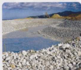
9 Calabria - A new frontier