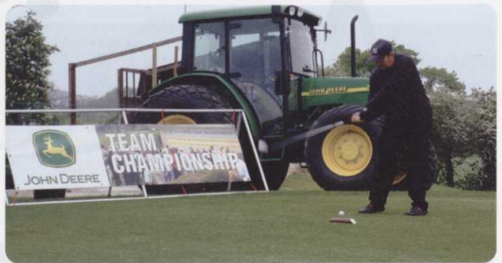
The photograph shows a team member teeing off at the 2002 Team Championship regional qualifying golf tournament organised by John Deere Midlands dealer Henton & Chattell at Cotgrave Place Golf Club in Stragglethorpe, Nottingham, in May, which attracted 23 teams - the biggest entry to date - and started with breakfast at John Deere Limited's headquarters in Langar.

Each winning team from the regional qualifiers - consisting of two members of the club's board or committee, plus the club professional and greenkeeper - goes through to the Great Britain and Ireland national final at The Belfry on August 19, a month ahead of the Ryder Cup, to play for a place in the world final at Grayhawk Golf Club in Scottsdale, Arizona, USA in November. Teams will be joined at The Belfry by a representative of their local John Deere dealer. By the end of May, 15 regional qualifying tournaments had been completed, involving 207 British and 55 Irish teams - with the host club's team winning in four. Another 11 of