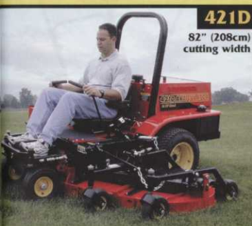
421D 82" (208cm) cutting width

The 421D represents a completely new price-point for an articulating, zero-turning radius, wide-area mower.