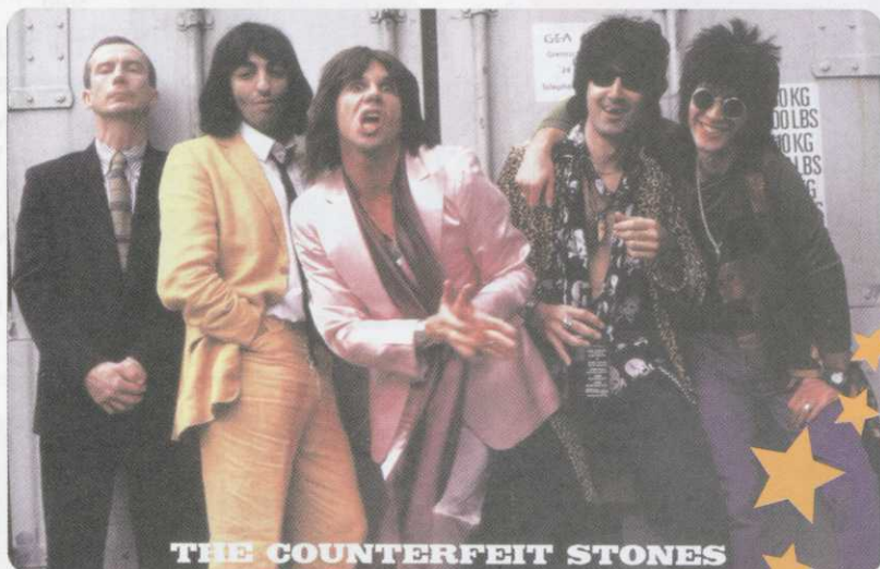
THE COUNTERFEIT STONES

Dress - Lounge Suit/Jacket and Tie. Cost: £ 32 per person.