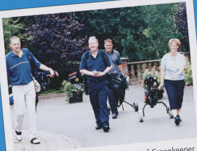
The Warners Midland team, printers of Greenkeeper International, prepare to tackle the Aldwark Manor course.