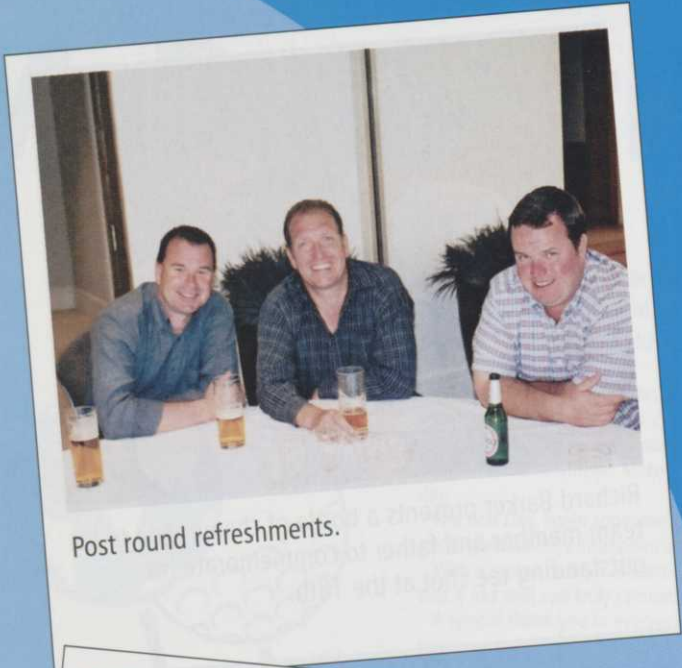
Post round refreshments.