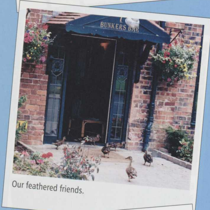
Our feathered friends.