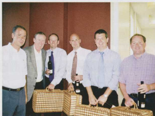
Haifa Chemicals team.