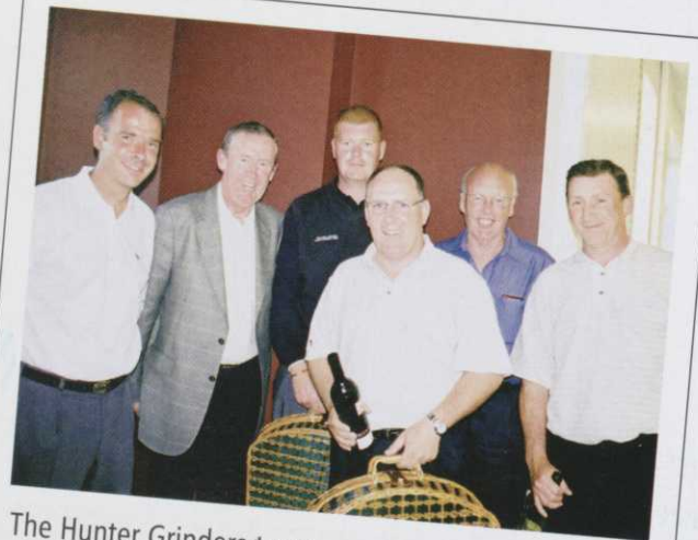
The Hunter Grinders team.