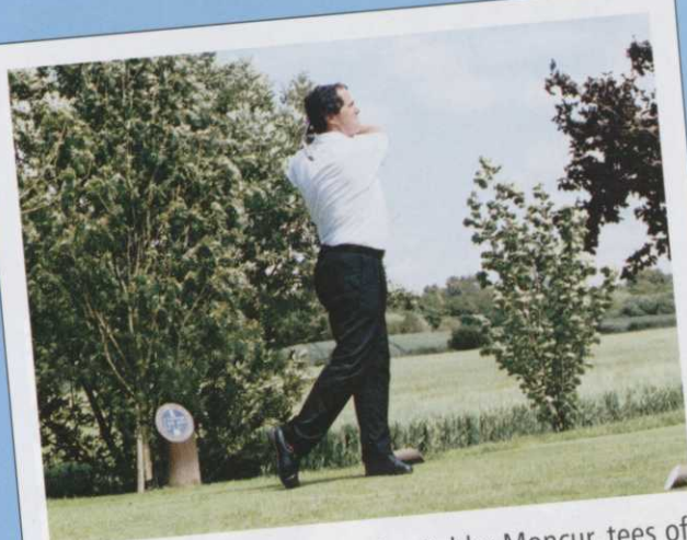
Ex Newcastle United Captain, Bobby Moncur, tees off at the 1st.