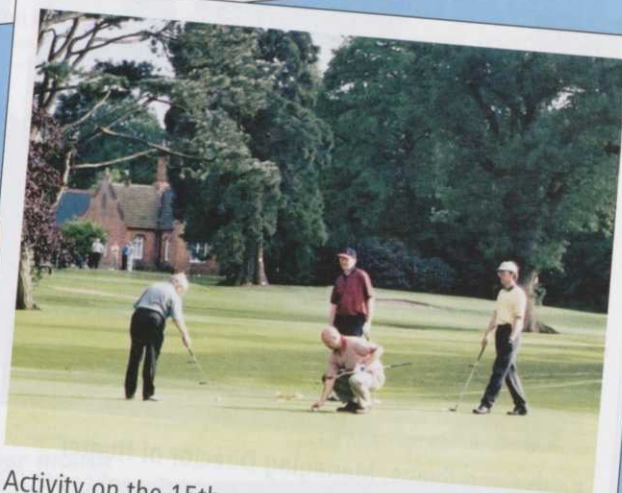
Activity on the 15th green.