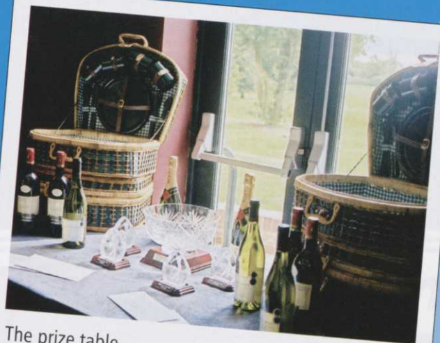
The prize table.