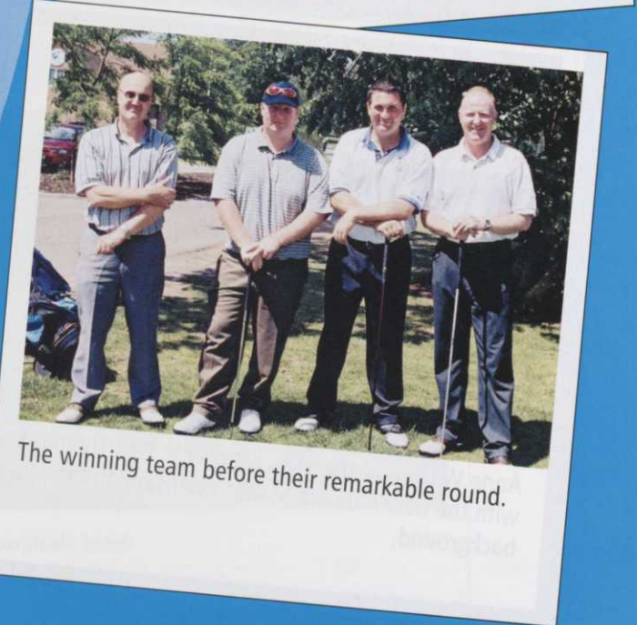
The winning team before their remarkable round.