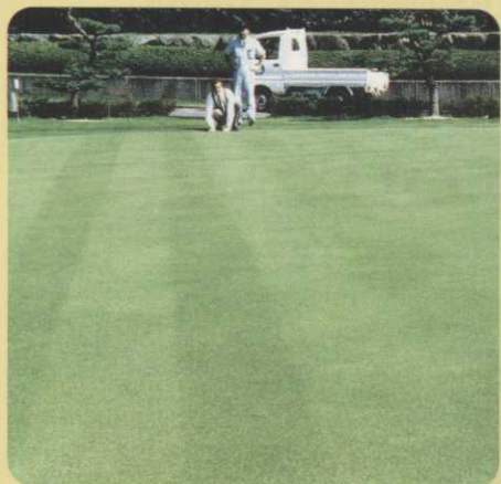
Above: Both lapped and non-lapped grass