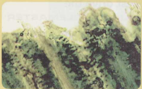
Above: Magnification of a lapped cut